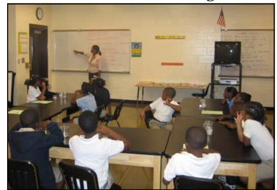
Ingram-Pye Elementary Classroom