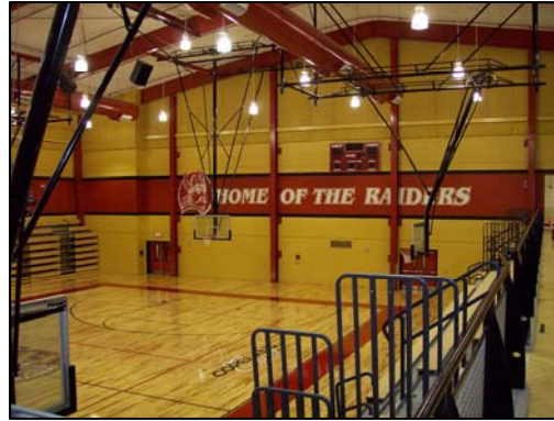
Northeast High's Mark Smith Gymnasium