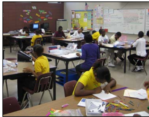
Ballard-Hudson Middle School