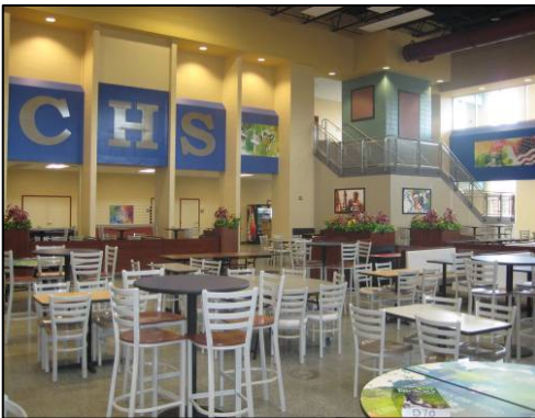
Central High Courtyard & Outdoor Classroom