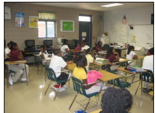
Weaver Middle Classroom Addition