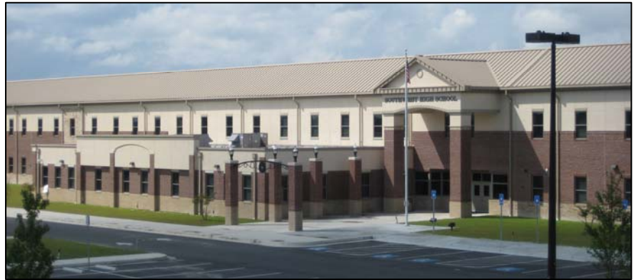
Southwest High School