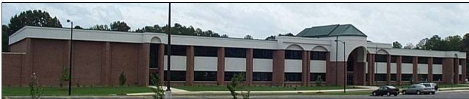
Hutchings Career Center