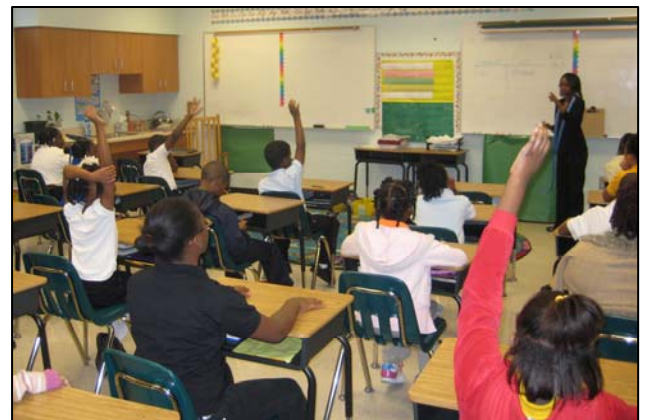
King-Danforth Elementary Classroom Addition