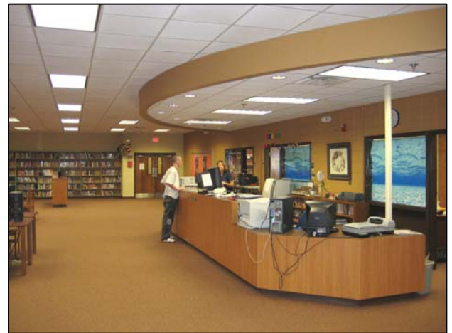
Northeast High Media Center