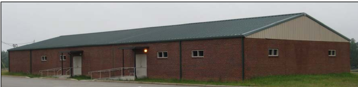
Rutland High Field House